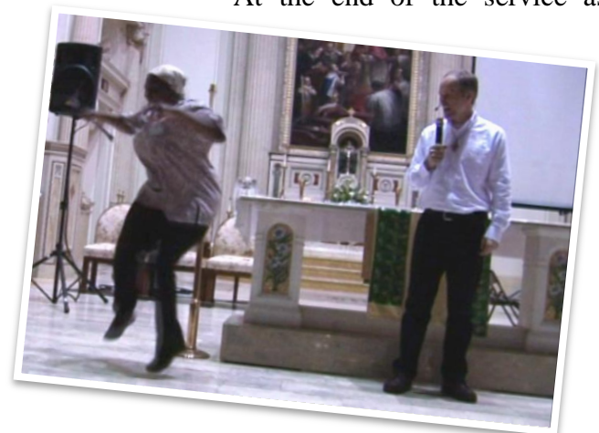
Lame woman jumping after the prayer

However the organisers did great publicity in the local newspaper and in the Catholic press and on the day the church was completely full with people standing at the back.