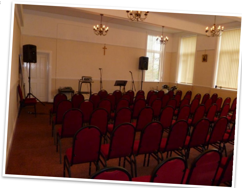
The recently renovated conference room

As any of you who have attended a course here in Highfield House over the past few years will know we had an extremely dilapidated Conference Room which was in urgent need of a complete refurbishment. I am delighted to be able to report that your generosity and those of other people who contributed have meant that we have been able to completely renovate the Conference Room. This has included a complete redecoration of the room, a new carpet, blinds and 100 new chairs – we hardly know ourselves. Those of you who have visited us over the Summer will have been amazed at the transformation.