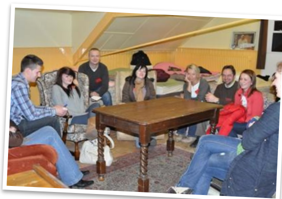
Equipping others to be a witness