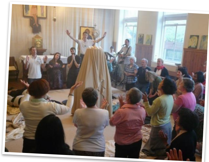
Fire & Light: Praising Jesus in the Blessed Sacrament

"I need and want more! The topic could be explored deeper and further. Will there be a Called to Glory III?" (yes, there will! In February 2012)