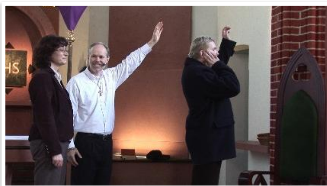
Deaf man healed

We found the retreat really fruitful and it made our faith grow significantly. We have also been receiving confirmations, including medical ones, of