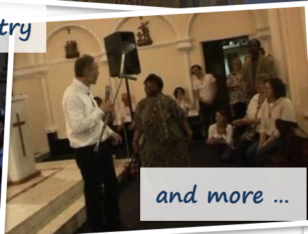
and more ...