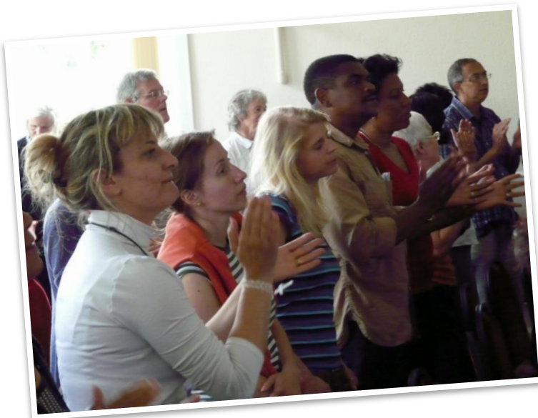
Praise and Worship time

This course is an excellent tool to help people grow in their Christian identity, develop in their ability to overcome sin in their lives, deal with spiritual