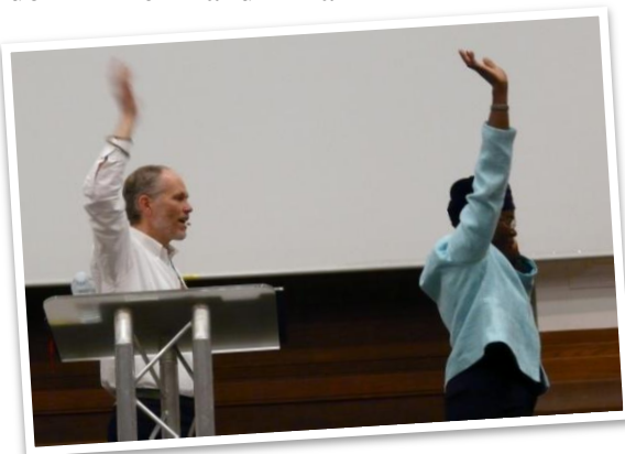
Deafness in right ear healed