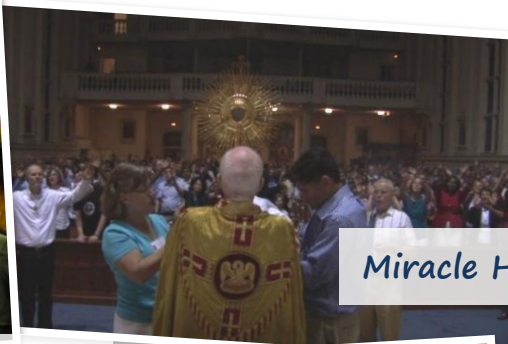
Miracle Healing Services