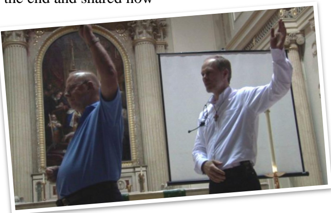
Healed from deafness, hearing aids redundant

during the ministry for deliverance she had felt power and love and goodness pouring into her while evil fled out of her, then great peace.