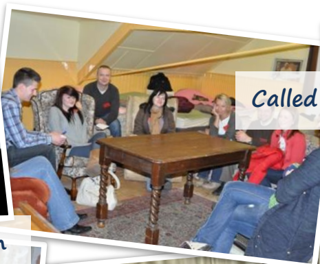
Called to Glory