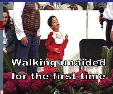
Walking unaided for the first time