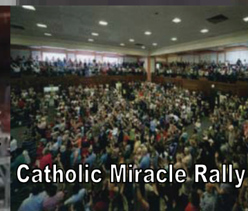
Catholic Miracle Rally