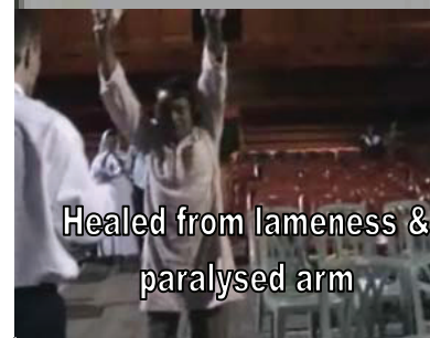
Healed from lameness & paralysed arm

If you do not want your details on our mailing list please tick here