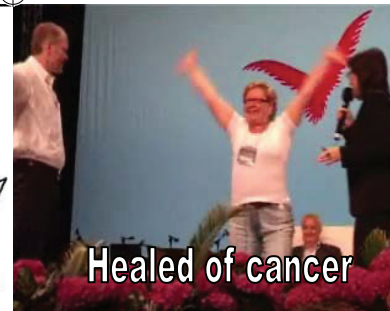
Healed of cancer

More information about the community at our website www.coretlumenchristi.org