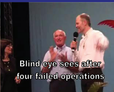
Blind eye sees after four failed operations