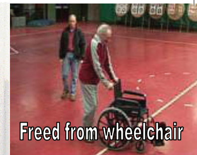
Freed from wheelchair

"...enable your servants to proclaim your word with great boldness. Stretch out your hand to heal and perform miraculous signs and wonders..." - Acts 4:29-30