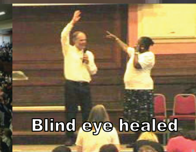
Blind eye healed