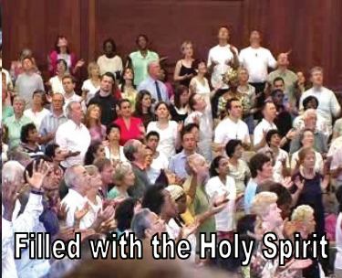
Filled with the Holy Spirit