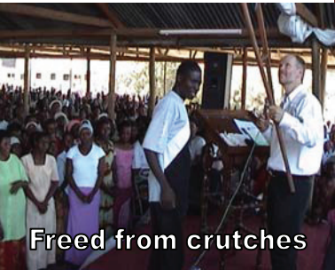
Freed from crutches