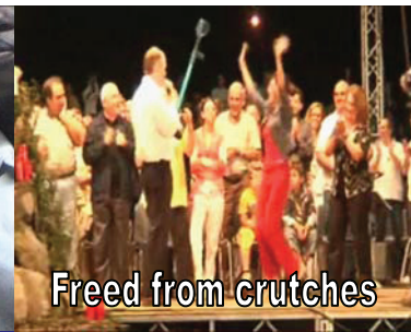
Freed from crutches