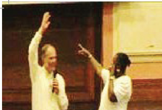
Blind Eyes See