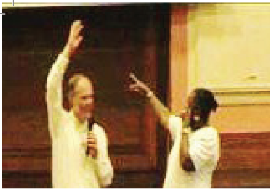
Blind Eyes See