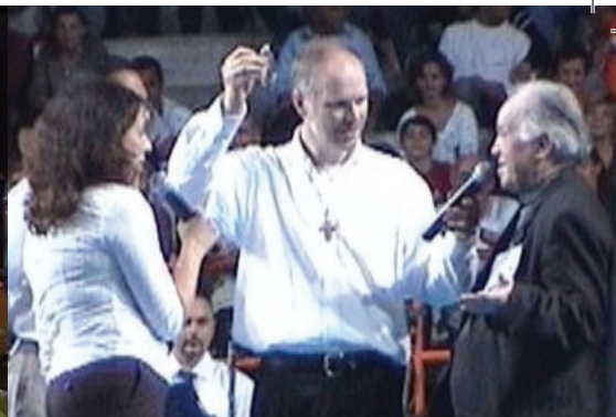
The Deaf Hear