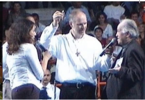
The Deaf Hear