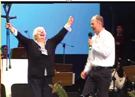
The Lame Walk