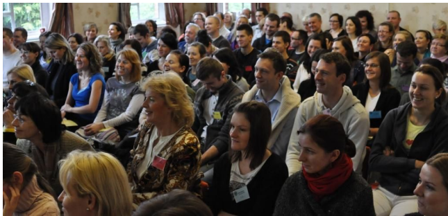
Barnabas Session, January 2011

booked a place for the next course and had a wonderful Barnabas Session. He was like a new man.