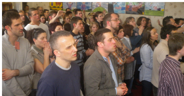
Some of the participants at the Philip Course

In November 2010 we ran a Philip Course, the aim of which is to bring people into a personal relationship with Jesus and be baptized in the Holy Spirit. We were packed out with about 100 participants in the room, not counting the team! During this course, the majority of participants – about 80% – invited Jesus into their lives for the very first time, and were baptised in the Holy Spirit, and 80% or even more started speaking in tongues.