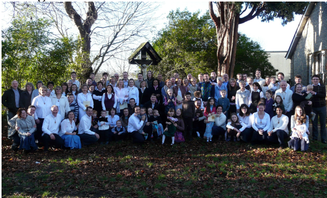
The Cor et Lumen Christi family, Chertsey

As some of you may know, for many years the community has had wonderful people who, though not members, shared our values and worked with us in our mission. Some of these were in our Polish team, others in our Fellowship in Cumbria, others friends and informal co-workers. We felt that the time was right for us to establish one coherent body with a clear identity and a common covenant of prayer, mission and lifestyle, to which these lovely people could belong.