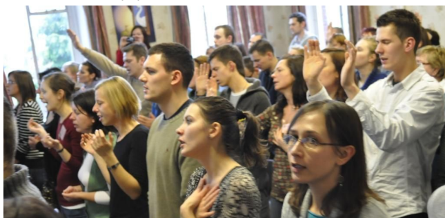
Worship at the Barnabas Session

One of the Polish priests who helps us from time to time during our courses, said that no one in Poland is seeing so many coming to such courses. Only God can work such wonderful things among Poles – not in Poland but in England. May God be praised!