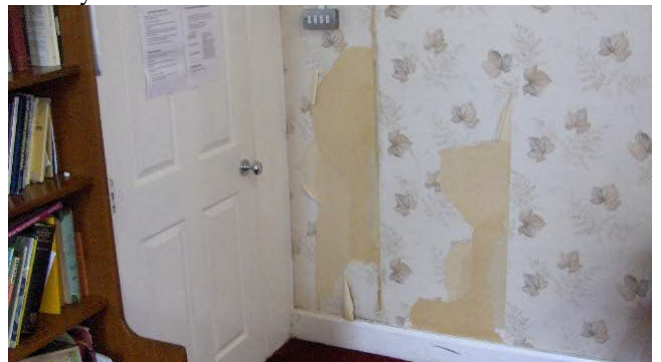
Walls in need of redecoration

We are decorating and converting our conference room into a fully equipped conference facility. This will require about £13,000 which will allow for a complete refurbishment of the room as well as the installation of upgraded electrics, projector and better seating etc. With well over half the conferences held in Highfield House last year full to capacity this overhaul will make a great improvement to the way we are able to accommodate people in our main conference facility.