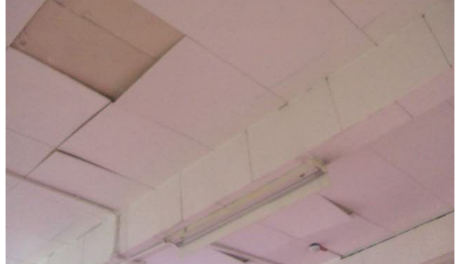
Conference room: Ceiling tiles slowly coming off

that have taken place here with God working His wonders in people’s lives and we need to have facilities that honour this and make people’s time with us more comfortable and better serve the teaching and ministry which take place on the courses.