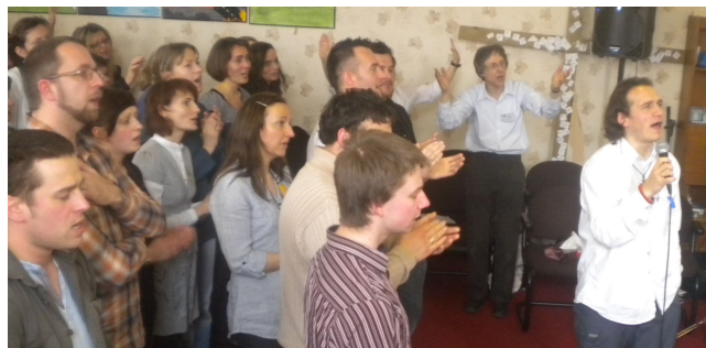
Praise during the Philip Course

For the last few years we have been running weekend retreat courses for Poles living in England and we now have about 500 participants over 5 courses every year, mostly young people under 30; a total of about 2,500 since we started!